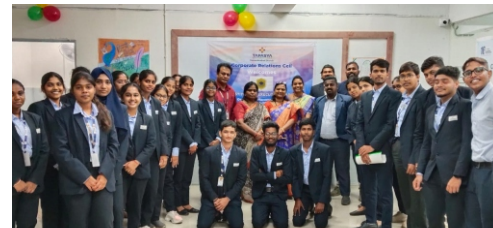
PLACEMENT SUCCESS MEET